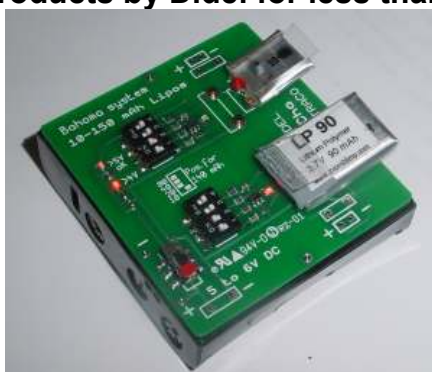
Price 38 CHF ca 38 USD